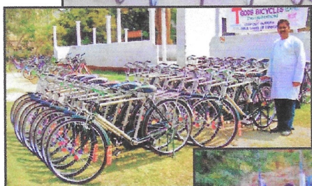
Some of the 244 bicycles being given out.