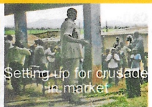
Setting up for crusade in market