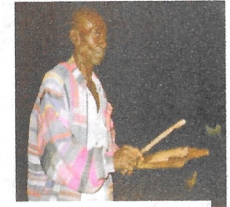
The gong gong beater