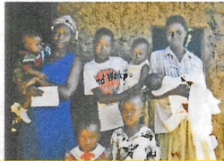
Family become Christians as a result of the crusade and are given tracts

The church is now an outreaching church going into the market places, schools, prisons and once or twice a month. They no longer sit on their pews for long, for now they have a heart to reach the lost.