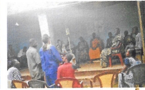
Standing before the King