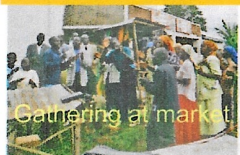
Gathering at market