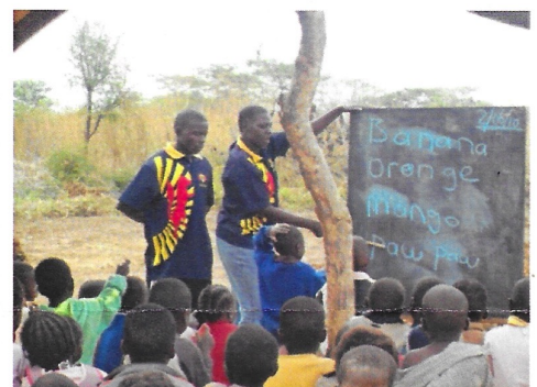
School being taught by volunteer teachers outside.