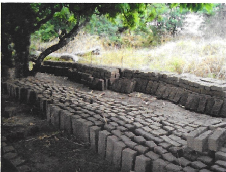
Volunteers from the area hand-made the bricks for the School Building.