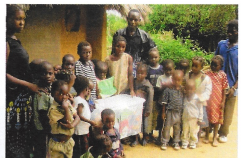
After receiving daily food and care for one year, it is easy to see that the orphans have improved physically. They are receiving schooling everyday and on Sundays attend Church and learn about God.