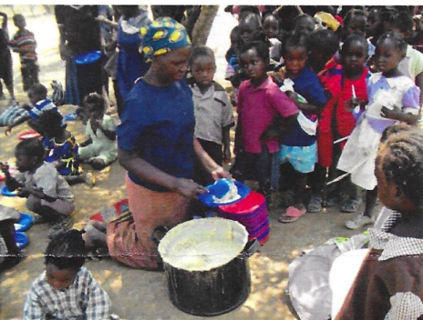
Each day the children line up to be fed.