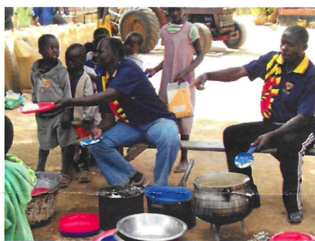
Volunteer teachers also help in the feeding program for the orphans.