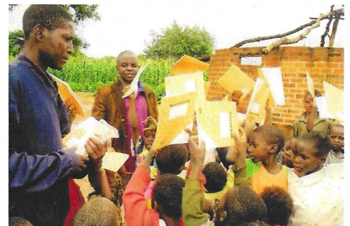
Excited orphans receiving school books, crayons, pencils, etc from a donor in NZ.