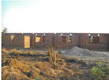
School building nearly completed, this was funded by a donor from England.